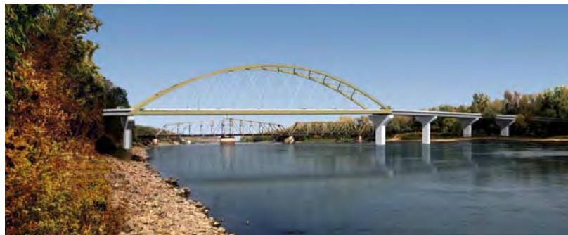
Artist's Rendering of Completed Bridge