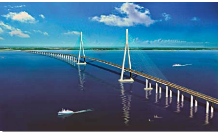
SuTong, China Design: China Highway Planning and Design Institute, Consultants Inc. (Beijing)