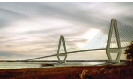
Cooper River Bridge in Charleston South Carolina Department of Transportation and Parsons Brinckerhoff, Trevlco Corporation and Case Atlantic Co

The O-cell method for testing the foundation capacity of bridge piers provides numerous advantages over conventional top-loading.