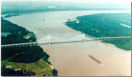
Hwy #82 Greenville Mississippi, USA Designers: HNTB Corp, Contractors: Massman Traylor Bros.