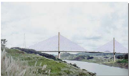
New Millennium Bridge over the Panama Canal Designers T. Y. Lin International Contractor: Bilfinger + Berger