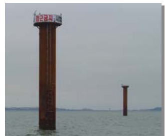
Test piles W6 and W8