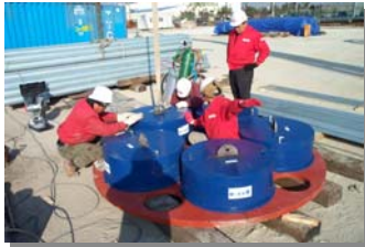
Assembly of the 5x 870 mm O-cell arrangement

Four preliminary test piles were proposed along the route in water between 5 – 14 m deep. These test piles were to be fitted with Osterberg cells (O-cells) to perform the static bi-directional load test as trying to achieve these loads with kentledge or anchor piles is impractical. Construction of the piles was with a permanent casing through the sea bed and into the soft rock, at 38-48 m, boring was carried out down to a maximum level of -56 m using reverse circulation drilling. Up to 9 levels of strain gauges and 3 sections of embedded telltales were deployed. An additional advantage of bi-directional testing is that concreting up to the top of the pile is not necessary, and for this project the concrete was brought up to the level of the sea bed.