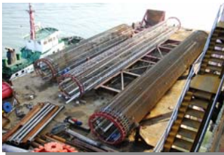
Cage sections in preparation. Several lengths of reinforcing cage had to be spliced together over the bore