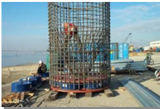
Final assembly of reinforcing cage with O-cells