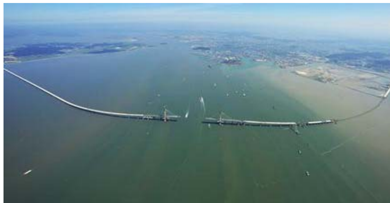
12.3km long, the Incheon Bridge opened in October 2009