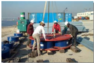
Assembly of the bearing plates for the O-cell arrangement