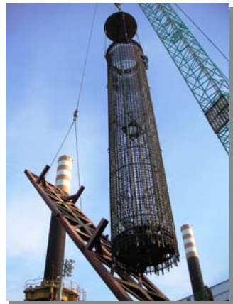
Bottom cage being prepared for insertion into the bore from the jack-up barge