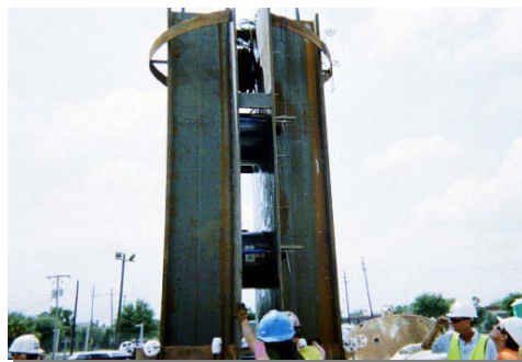
Two 16MN O-cells used to test the lateral stiffness of the Cooper Marl (between 19-21 m depth) on a 2400mm pile for the Cooper River Bridge.

The O-cell method is well suited for any size and capacity drilled shaft or pile, for tests both on land and off-shore.