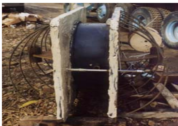
A 27MN O-cell used to test a 1500mm long by 1200mm diameter rock socket. Bearing plates are greased along the inside plane to facilitate concrete de-bonding.

In general, the split cylinder test is not carried out in the same manner as a typical lateral load test would be performed. It should be appreciated that the loads are being applied directly to the selected zone of interest and the results not influenced by elastic lateral deformation. At each increment, load and lateral displacement are recorded and the data is tabulated and plotted for use by the engineer.