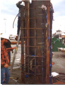
An O-cell assembly is prepared for installation using two 4MN O-cells for use in a 1200mm diameter shaft.

The O-cell method for testing the lateral stiffness of soil surrounding a foundation element provides numerous advantages over conventional lateral loading tests. This provides effectively the same results as a Goodman Jack but loading the full diameter of the foundation element.