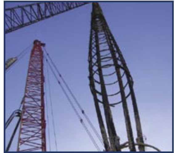
125 ft. (38m) of cage ready to place in grout

A crane-mounted hydraulic drill advanced the > 100ft.(30m) piles and grout was then placed as usual. The rebar cages with the O-cells affixed were then lowered into the grouted holes. The O-cell and cage assembly slipped smoothly through the