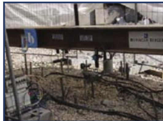
Bi-directional test in progress. Steel beam is used as reference frame for top of pile movement measurements.