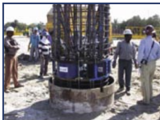
First O-cells being installed in UAE

Several world class projects in the UAE area are utilizing O-cell technology and the booming market for office towers and bridges in the region can only benefit by using this test method.