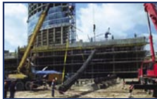
Current progress on plots 9 & 10 and the O-cell cage being lifted ready for installation

The desired maximum end bearing loading was specified as 3600 kips (16 MN). The effective mobilized total capacity in each of the test piles was 9450 kips (42 MN) approx. 4720 kips (21 MN) in each direction.