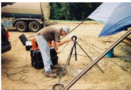
Test in progress