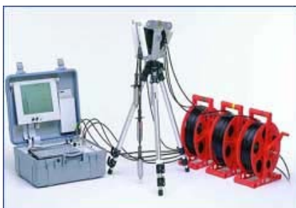
CSL Equipment from Olson

Crosshole Sonic Logging (CSL) is a test used to establish concrete integrity. The CSL test involves lowering ultrasonic probes to access tubes and as the probes are pulled to the surface a data processor records the passage of ultrasonic pulses (compression wave energy) from a source in one tube to a receiver in another tube (see diagram A).