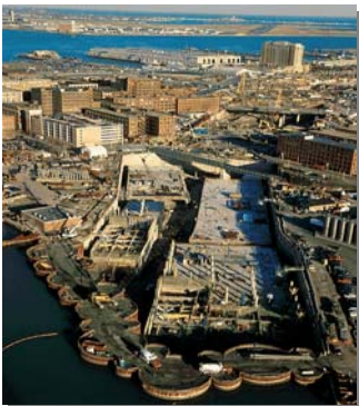
The Big Dig, Boston, MA