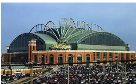
Miller Park