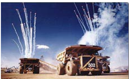
Athabasca Tar Sands – Syncrude Project