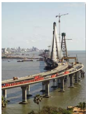
Under construction, May 2008