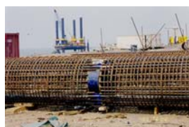
Upper level O-cell arrangement