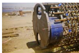
Lower level O-cell arrangement