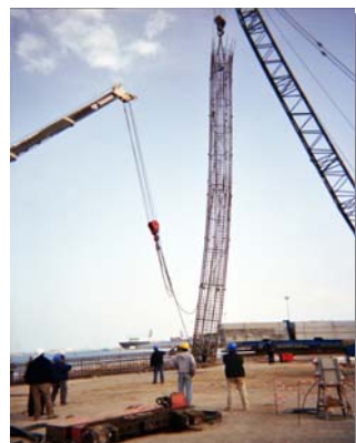
O-cell and cage assembly ready for installation