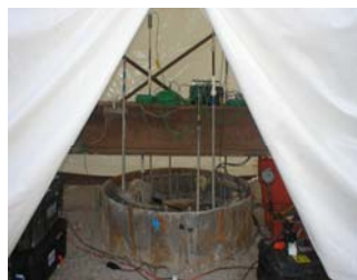
Bi-directional test in progress. The steel beam shown in the picture is being used as a reference frame against which pile movement was measured.