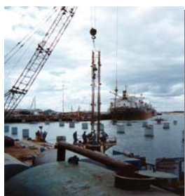
Pile construction offshore

As part of continuing development and expansion, a dry bulk terminal was planned. This required a large jetty to be constructed to allow deep-water access. The piling contract involved the installation of 116 piles in four rows, extending 300m from the existing quay into the harbour. The central two rows were 1.8m diameter while the two outer rows were 1.2m diameter.