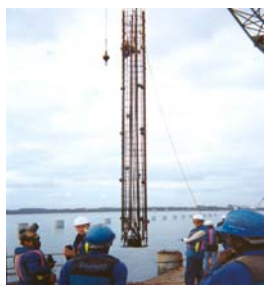
Pile cage showing O-cell assembly

Two single level O-cell tests were performed on one 1200mm and one 1800-mm nominal diameter piles constructed wet to depths up to 66m by Interbeton.