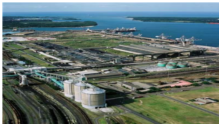
Aerial view of Richards Bay