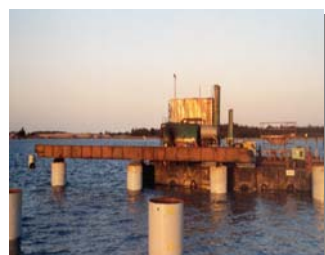
Pile test in progress