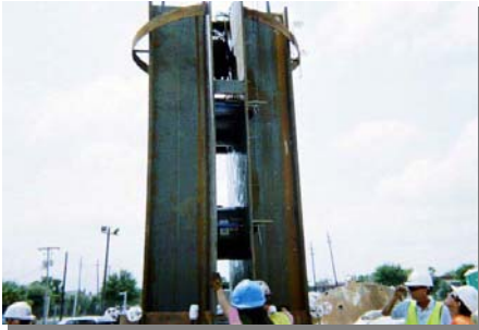
2-16 MN (3600 kip) O-cell® used to test the lateral stiffness of the Cooper Marl (between 19-21 m depth) on a 2400 mm (96") pile for the Cooper River Bridge.

The O-cell method for testing the lateral stiffness of a foundation element provides numerous advantages over conventional lateral loading tests.