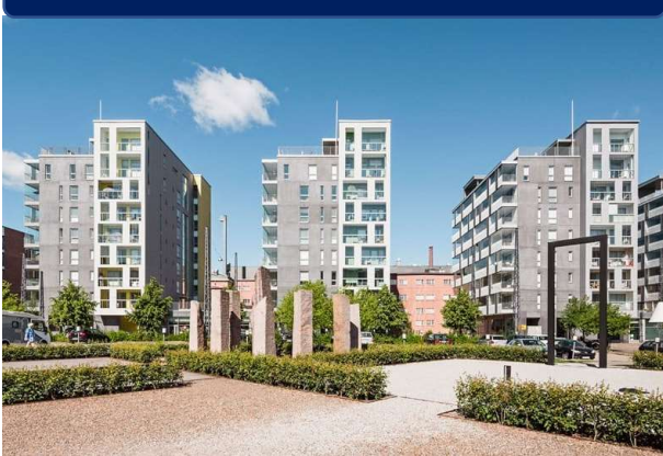
Arabianesirakentaminen - Finland

Due to reclamation of the coastal area using a variety of fill material over unstable glacial deposits, the area of Arabia in Helsinki suffers from continuous settlement. Since the pile design relies solely on end bearing, with significant consolidation, ensuring long term suitability of the pile base capacity was the goal of this static load testing program. Taking into consideration all the challenges, the use of the O-Cell methodology was clearly the best option as it allowed the test piles to be tested several times without disturbing the progress on site. Two 530 mm driven piles were installed with 330 mm O-Cell assemblies, to load the soil directly at the base of the element. After to the initial loading test the piles were retested 6 months later from a different ground elevation to determine any changes in performance over time.