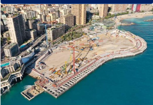
Anse du Portier - Monaco

Monaco has one of the highest population densities in the world and to satisfy the needs for increasing housing demand, a new project reclaiming more land from the Mediterranean has been initiated. Anse du Portier will be the next Monaco neighbourhood with 6 hectares and house 3400 luxury apartments, underground car park and retail shops. Due to the uncertainty regarding the rock strata and other geotechnical parameters, Fugro Loadtest were commissioned to test several piles with O-Cell methodology. Three 1400 mm diameter piles of lengths 24, 50 and 56 metres and were load tested to over 50 MN. The test results obtained for all the piles allowed the use of Cemsolve® software to determine the total ultimate pile skin friction capacity, the ultimate end bearing and stiffness.