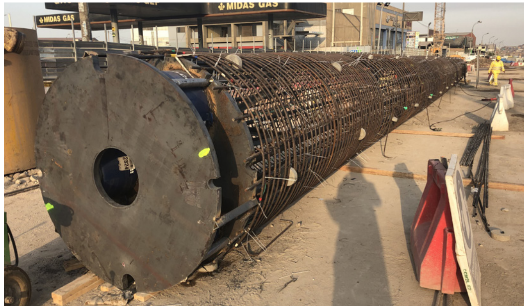
O-Cell cage assembly

Accurate measurement of actual foundation performance allows engineers to optimize foundations designs while knowing that safe foundation performance is possible for extreme events.