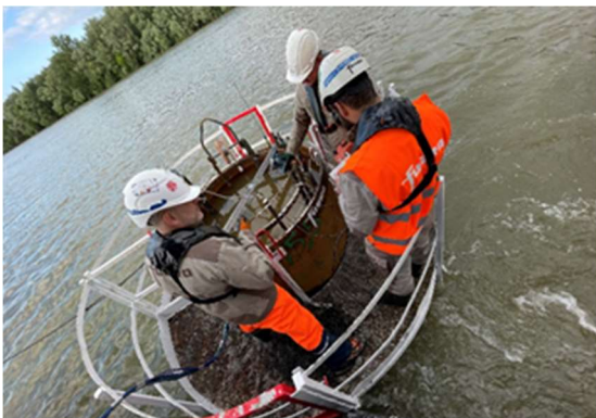
Integrity testing of one of the piles.