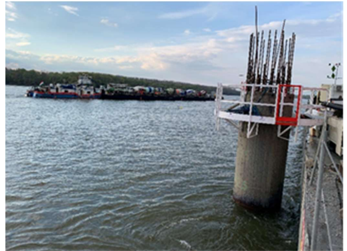
Concrete wagons on a barge ready for their delivery into the pile in the middle of the river

Full-scale static load testing was able to be carried out using O-Cell® methodology without the need to provide potentially unsafe and very costly anchor piles over water, revealing the geotechnical behaviour of the base of the piles as well as the skin friction parameters along the pile shaft. These results were critical for the project foundation designers and demonstrated the actual in-situ behaviour exceeded design expectations.