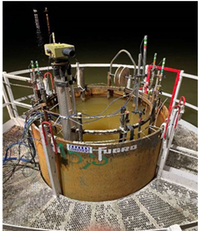
O-Cell® test in progress.