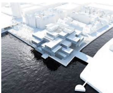
Architects rendering of Bryghaus Projekt