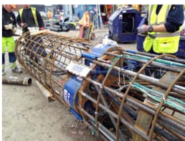
Construction of cages underway showing final 4 x 405mm O-cell configuration