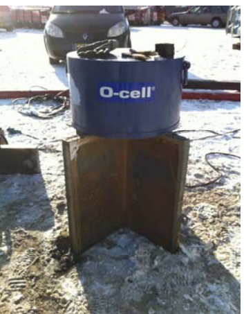
O-Cell with rock socket seating arrangement