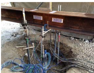
O-cell Test in progress