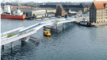
Artistic impression of inner harbour bridge

Project: Bridge over Inderhavnen Location: Copenhagen, Denmark Consultant: COWI Main Contractor: Pihl & Son