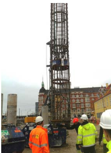
Cage Installation in progress