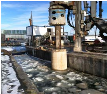
Construction of the test pile underway