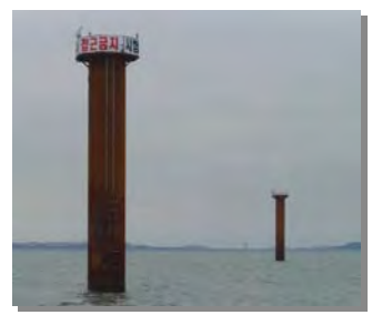
Test piles W6 and W8