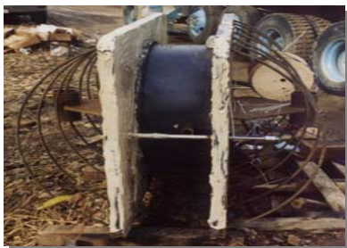
A 27MN O-cell used to test a 1500 mm long by 1200 mm diameter rock socket. Bearing plates are greased along the inside plane to facilitate concrete de-bonding.

In general, the split cylinder test is not carried out in the same manner as a typical lateral load test would be performed. It should be appreciated that the loads are being applied directly to the selected zone of interest and the results not influenced by elastic lateral deformation. At each increment, load and lateral displacement are recorded and the data is tabulated and plotted for use by the engineer.