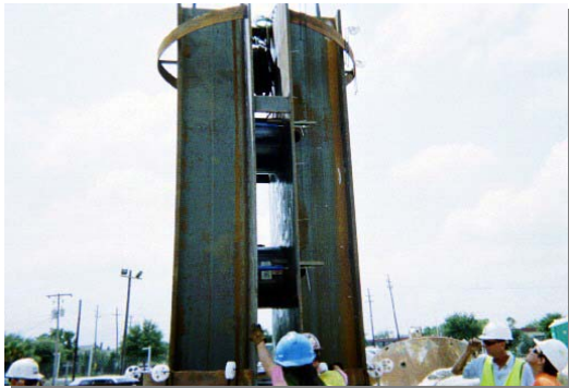
Two 16 MN O-cells used to test the lateral stiffness of the Cooper Marl (between 19-21 m depth) on a 2400 mm pile for the Cooper River Bridge.

The O-cell method for testing the lateral stiffness of soil surrounding a foundation element provides numerous advantages over conventional lateral loading tests. This provides effectively the same results as a Goodman Jack but loading the full diameter of the foundation element.