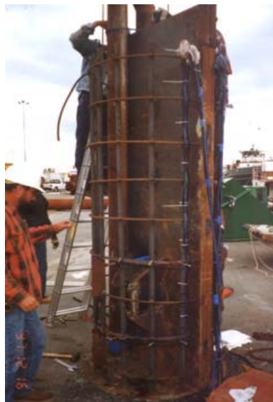
An O-cell assembly is prepared for installation using two 4 MN O-cells for use in a 1200 mm diameter shaft.

The O-cell method is well suited for any size and capacity drilled shaft or pile, for tests both on land and off-shore.