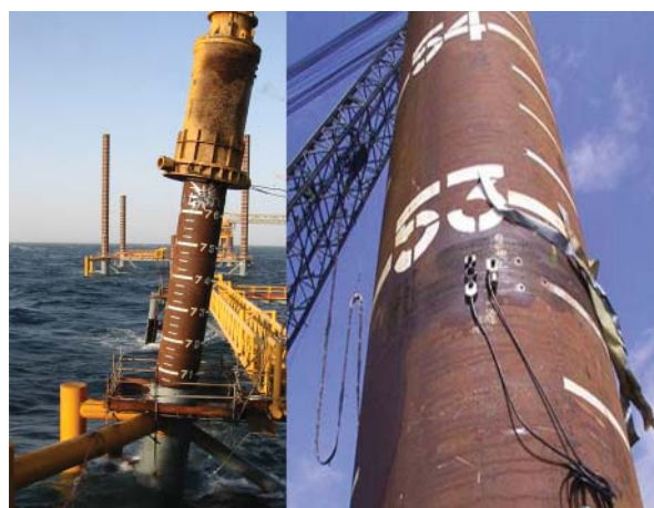
Hammering offshore pile / Presenting transducers attached to the pile

Accelerometers and strain transducers are attached to the pile at a small distance from the pile top. Signals produced by each hammer impact are recorded and analysed by a dedicated data acquisition system. The equipment is light, small, handy and particularly suitable for offshore barge installation conditions. Waterproof transducers and cables are available for underwater driving.