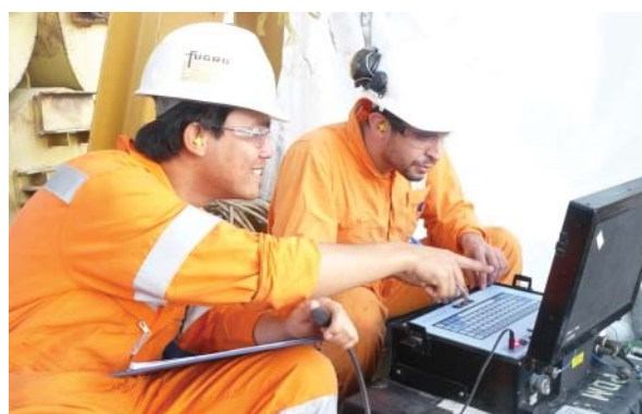
Acquiring data in real time by geotechnical engineers