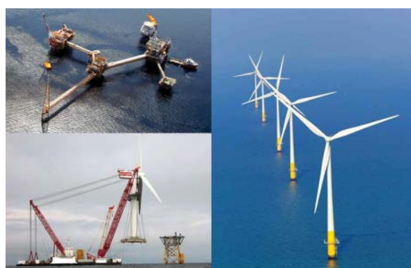
In working offshore installations

FUGRO engineers are used to working on the installation barge in close cooperation with Client field engineers and hammer operators in order to optimize driving operations, conclude on pile acceptance or advise Client for remedial procedures if needed.