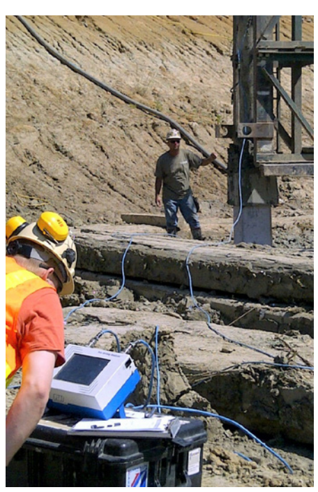
PDA field testing

Proper interpretation of dynamic test results requires a high level of technical expertise, which Fugro engineers maintain through training and assessment. Detailed resistance and integrity analysis for a variable pile model is performed on end-of-drive or restrike blows using the CAPWAP computer program.